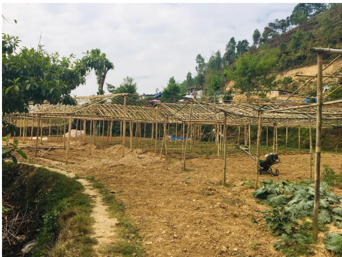
Tunnels built by one of the villager, after participating in the agriculture training provided by ICA Nepal