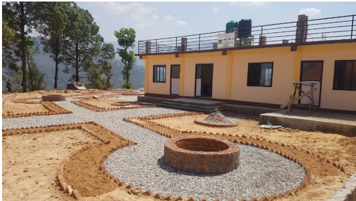
Community Training Centre built by ICA Nepal with ICA Japan in Sindhupalchowk district