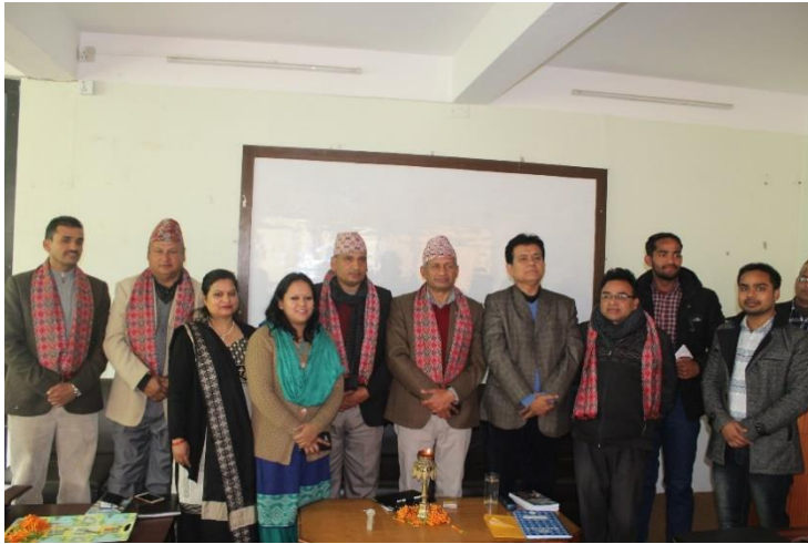
Along with Foreign Minister Pradip Gyawali during the launching of Nepali edition of Compassionate Civilization